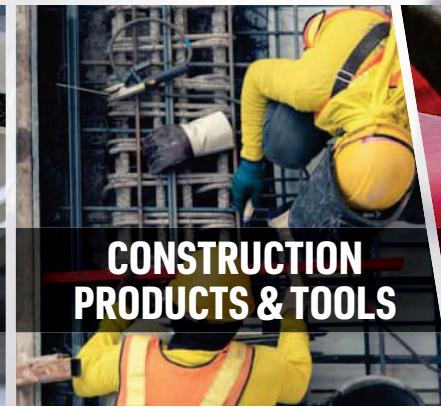
CONSTRUCTION PRODUCTS & TOOLS