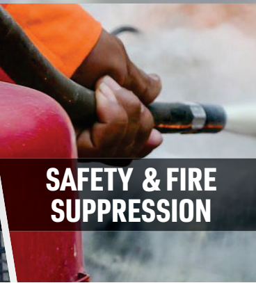
SAFETY & FIRE SUPPRESSION